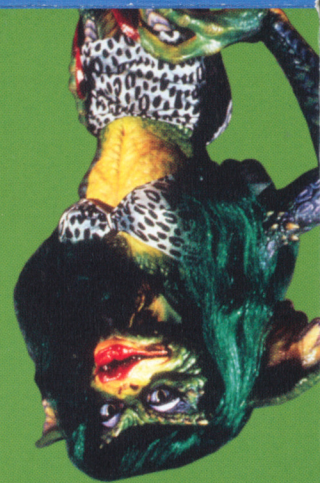
Photo: Genjines 2: The New Batch , courtesy of Photofest, Cover: Kooky , courtesy of Biograf Jan Svěrák

PETER JAY SHARP BUILDING 30 LAFAYETTE AVENUE BROOKLYN, NY 11217-1486