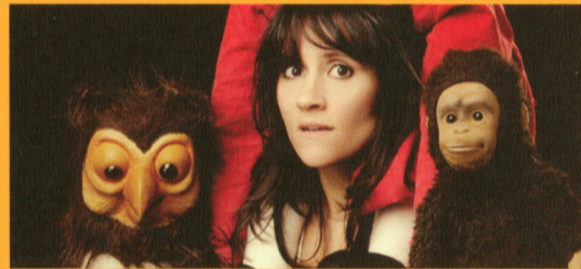
Her Master's Voice