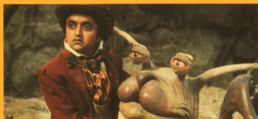
The NeverEnding Story