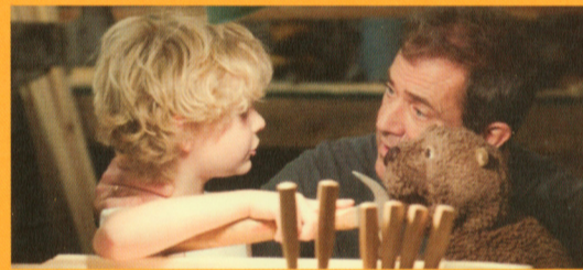
The Beaver