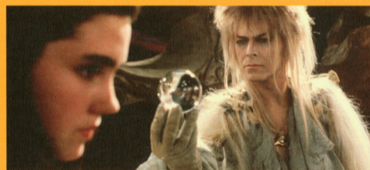
Labyrinth