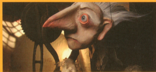
Where is Who I Was and Am