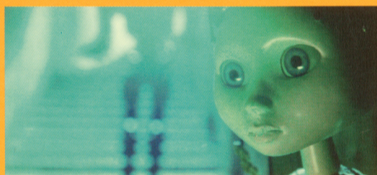
Strings

The NeverEnding Story (1983) Dir. Wolfgang Petersen Fri, Nov 9 at 6:50pm Q&A with Alan Oppenheimer, voice of Falkor, Rockbiter, and G'mork With Noah Hathaway, Barret Oliver Bullied in his ordinary life, young Bastian is drawn into the mythical world of Fantasia while reading a book called The NeverEnding Story . Fantasia is in peril as the Nothing threatens to destroy it, and its only hope is Bastian's imagination. With awesome puppets, music by the legendary Giorgio Moroder, and special effects the likes of which cannot be seen on the big screen today. In 35mm. 8+