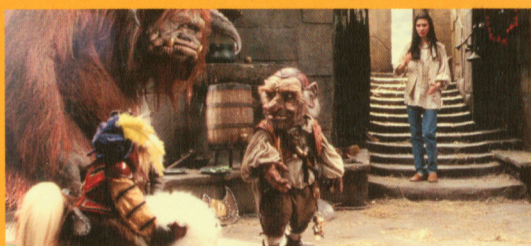
Labyrinth