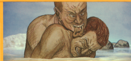
Dante's Inferno, courtesy of Dante Film LLC