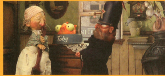
Mother Hubbard Among Others