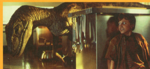
Jurassic Park