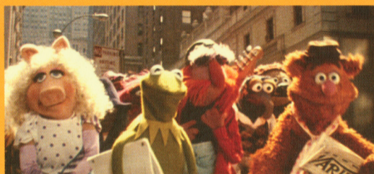
The Muppets Take Manhattan