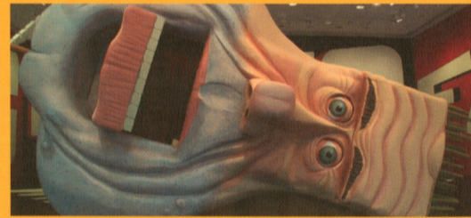
Beauty is Embarrassing

The Beaver (2011) Dir. Jodie Foster Sat, Nov 10 at 9:30pm With Foster, Mel Gibson Once a successful toy executive and family man, Walter Black (Gibson) finds himself deep in depression until a beaver hand puppet enters his life and helps him rediscover himself. Foster directs and co-stars in this touching drama. In 35mm.