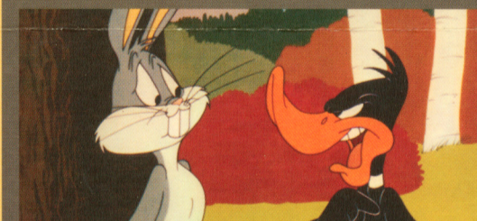
Rabbit Seasoning